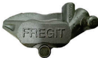
2 PISTON CALIPER