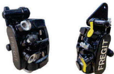
( Front Left CBS ) ( Front Right CBS )